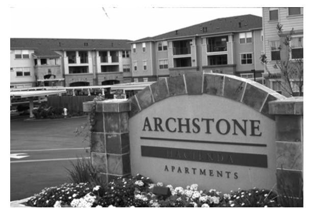
Fig. 1. Archstone has developed typical suburban apartments such as these in nearly every state in the country.

This shift in suburban population holds the potential for a different type of suburban reality. The suburbs have historically focused around idyllic pastoral images that were centered on family life and the creation of village-like communities. The Garden City movement and romantic countrified traditions have historically been, and continue to be, the primary models for suburban development. The latest incarnation of this model has been Urbanist developments which the New continue to hold up small European hamlets and areas such as Letchworth, England as models for development. With the diversifying of the suburban dweller and the suburban lifestyle, this pastoral ideal becomes only one of many possible models for suburbia.