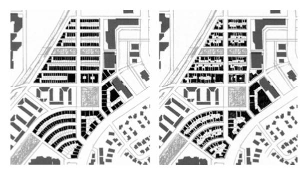
Fig. 5. Strict platting designation (left) compared to a looser platting approach (right) that allows and invites agglomeration in order to create a varied physical environment.

Designs for semi-urban nodes should not simply attempt to create a new focal point for a specified area. Instead, they should build upon existing moments of activity and connect these moments to a central core. As activity and interaction are the goals, existing areas of be highlighted activity should and incorporated. Commercial strip malls can be seen as one of the few areas in suburbia where the automobile is briefly left behind and interaction occurs. This auto-dominated area will continue to exist as a large portion of the population does not and cannot live in close enough proximity to eliminate the automobile. Semi-urban designs should build upon this moment of activity and connects existing auto-oriented commercial areas to more oriented pedestrian commercial and This will allow for the residential areas. integration of new and existing commercial areas, positioning new commercial streets as extensions of the strip mall and capitalizing on existing activity.