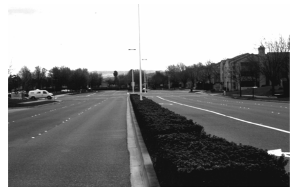
Fig. 3. Seven lane road separating two suburban apartment developments, each with densities over 30 units/acre and located less than a quarter mile from retail area. (Pleasanton, California)

It provides an alternative for those who are still single, for those who cannot or wish not to buy a home, for those without children, recently divorced, or recently left with an empty nest. These are individuals who often prefer to rent rather than own, are more transient, and are often uninterested in the quality of local schools or the rate of local population property taxes. This is fundamentally different, in a sociological sense, from the suburban nuclear family. They often do not have an internal family structure and therefore a large amount of interaction and socializing occurs outside the These populations invite dense home. interaction and would thrive in a more urban environment.