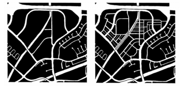
Fig. 4. Typical suburban street patterns (left) and a proposed denser and more varied street pattern for the same area (right).

As has been observed in a number of recent design alternatives for suburbia, suburban streets and open space need to be rethought. Streets and open space are the critical armature necessary for the creation of the semi-urban experience. They are the arena through which the potential and forced interactions set up by density are allowed to play themselves out. The typical large block, suburban street pattern with its minimal intersections and minimal number of connections to larger streets must be redesigned. By thinning the width of some of the existing streets and adding a number of smaller, interconnected streets, areas as a whole become more walkable. Streets are no longer primarily designed for the automobile, and pedestrians enjoy a number of different options to traverse any given area (see fig. In addition, a more intricate street 4). pattern allows and guarantees a finer grain of development with a larger number of accessible lots.